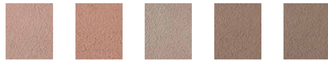
BN-1714R (1 bag) Santa Fe Tan BN-1714R (2 bags) BN-2680R (1 bag) Balsam Wood BN-2680R (2 bags) BN-2680R (3 bags)