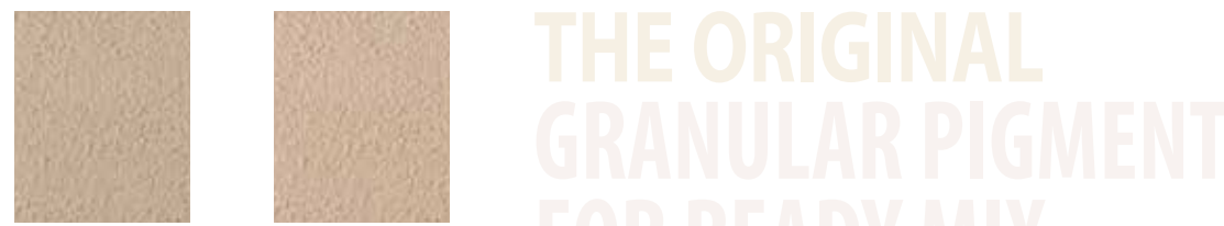
JO-7950R (1 bag) Camel JO-7961R (1 bag) Desert Sand

THE ORIGINAL GRANULAR PIGMENT FOR READY MIX