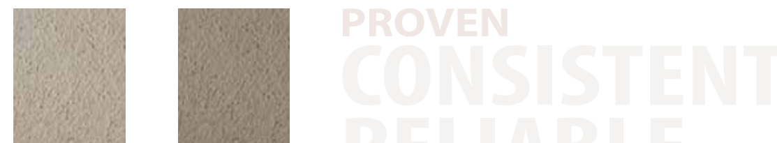
BN-2550R (1 bag) Khaki BN-2550R (2 bags)