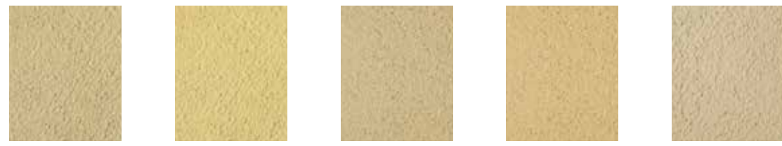
JN-2400R (1 bag) Champagne JN-2400R (2 bags) JN-4010R (1 bag) Gold JN-4010R (2 bags) JN-4411R (1 bag) Bamboo