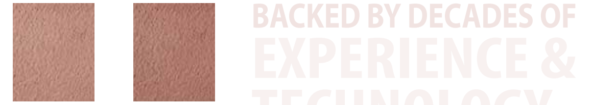
RG-3072R (1 bag) Maroon RG-3072R (2 bags)

BACKED BY DECADES OF EXPERIENCE & TECHNOLOGY