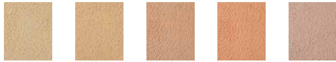
JN-4416R (1 bag) Buff JN-4416R (2 bags) JO-7960R (1 bag) Goldenrod JO-7960R (2 bags) JO-4159R (1 bag) Mystic Shadow