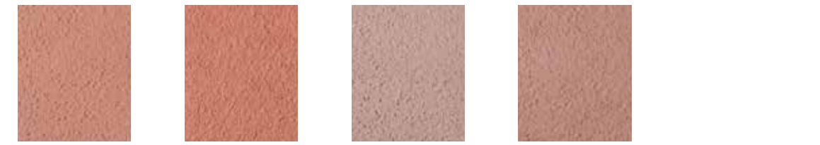
RG-2835R (1 bag) Egyptian Red RG-2835R (2 bags) RG-3077R (1 bag) Redwood RG-3077R (2 bags)