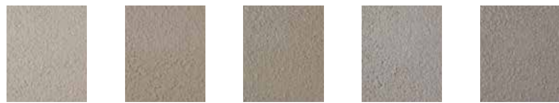
NR-5011R (1 bag) Shadow Gray NR-5010R (1 bag) Gray Cloud NR-5010R (2 bags) NR-5157R (1 bag) Monsoon NR-5157R (2 bags)