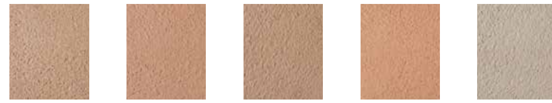
BN-2530R (1 bag) Nutmeg BN-2530R (2 bags) BN-2531R (1 bag) Potter's Clay BN-2531R (2 bags) BN-2681R (1 bag) Willow