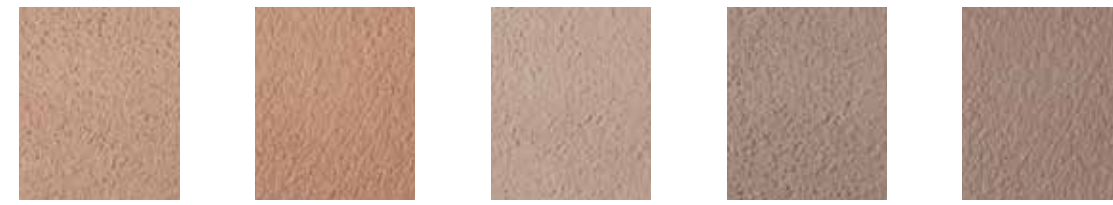
BN-1703R (1 bag) Copper BN-1703R (2 bags) BN-1701R (1 bag) Taupe BN-2520R (1 bag) Chaps BN-2520R (2 bags)