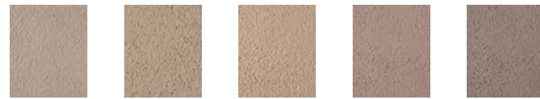
BN-2730R (1 bag) Biscuit BN-2739R (1 bag) Stone Castle BN-2739R (2 bags) BN-1616R (1 bag) Plum BN-1616R (2 bags)