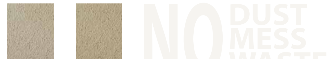
VT-3450R (1 bag) Olive VT-3450R (2 bags)