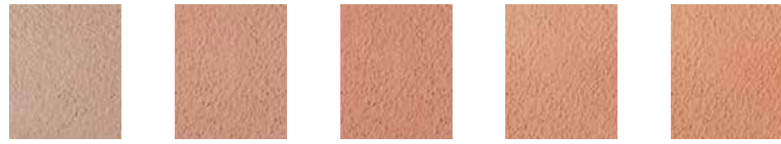
JO-4131R (1 bag) Sahara JO-4134R (1 bag) Orange Blossom JO-4134R (2 bags) JO-6435R (1 bag) Sedona JO-6435R (2 bags)