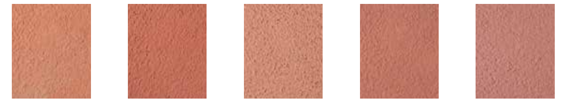
RG-2827R (1 bag) Baja Red RG-2827R (2 bags) RG-2832R (1 bag) Salmon RG-2832R (2 bags) RG-2846R (2 bags) Raspberry