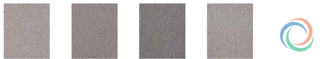
NR-5105R (1 bag) Smoke NR-5105R (2 bags) NR-5105R (3 bags) NR-5171R (1 bag) Midnight Bay