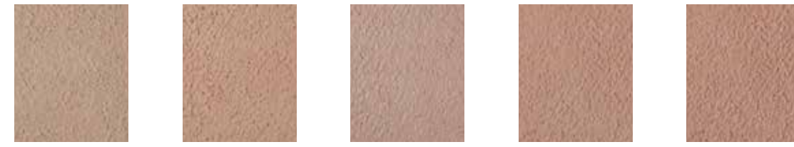
BN-1705R (1 bag) Rustic BN-1705R (2 bags) BN-1711R (1 bag) Hazelnut BN-1711R (2 bags) BN-1711R (3 bags)