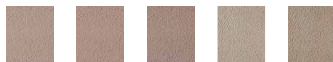
BN-2510R (1 bag) Maple BN-2510R (2 bags) BN-2510R (3 bags) BN-2978R (1 bag) Chocolate Fudge BN-2978R (2 bags)